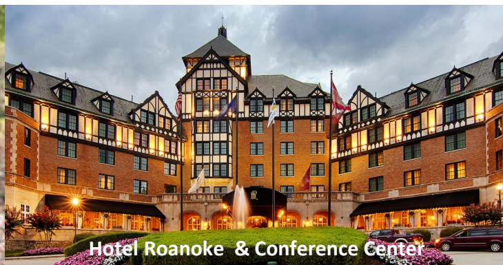
Hotel Roanoke & Conference Center